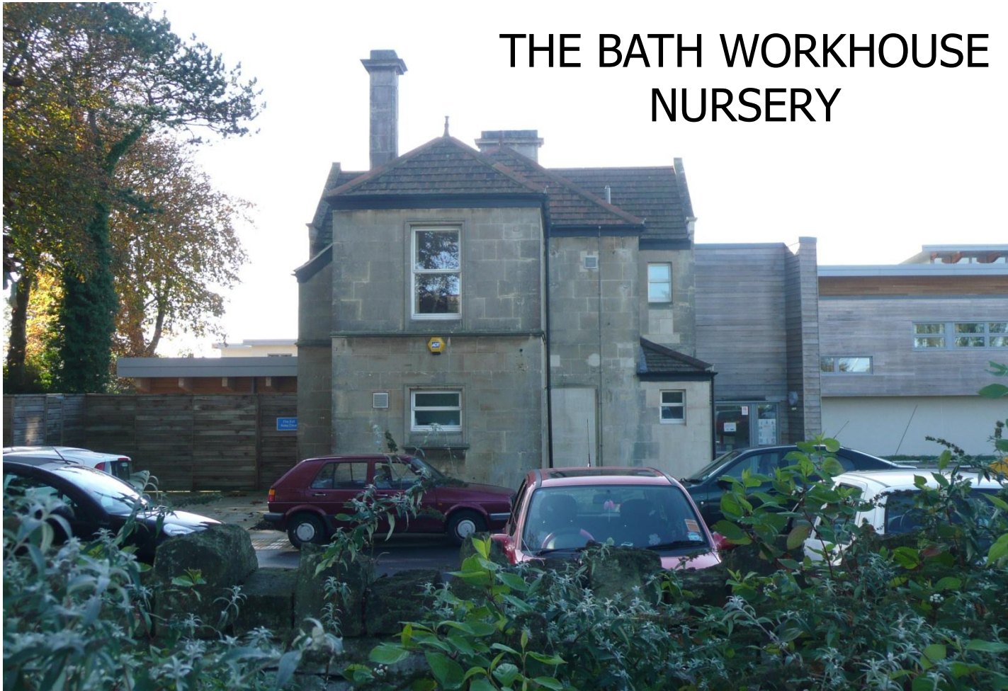
THE BATH WORKHOUSE NURSERY